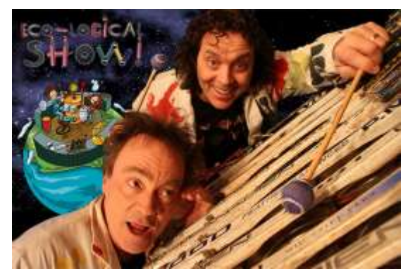
Festive, interactive and unifying

With more than 2,000 performances in various venues, festivals and schools, CréaSon's Eco-Logical Show! is available on a tour across Canada. In English or in French, CréaSon unites children of all ages in a big "environmusical" party. Being ecological is so logical!